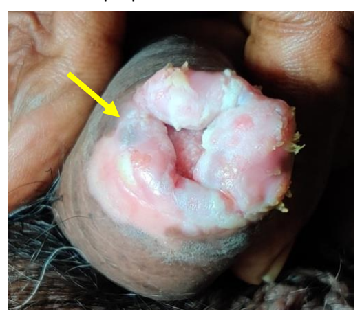
Figure 1: Multiple soft pinkish red nodules in the prepuce (before circumcision).

On examination, the prepuce was unretractable and studded with multiple soft pinkish-red nodules of varying sizes, ranging from 0.5 mm to 15 mm in diameters. The outer skin of the prepuce showed a whitish ill-