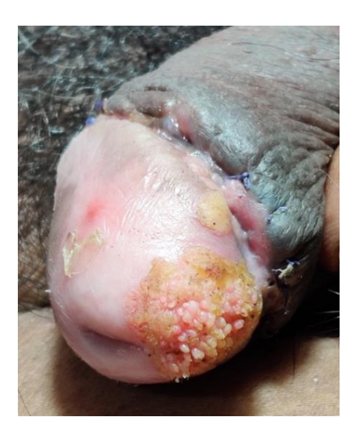
Figure 4: Lesions remaining in the glans after circumcision